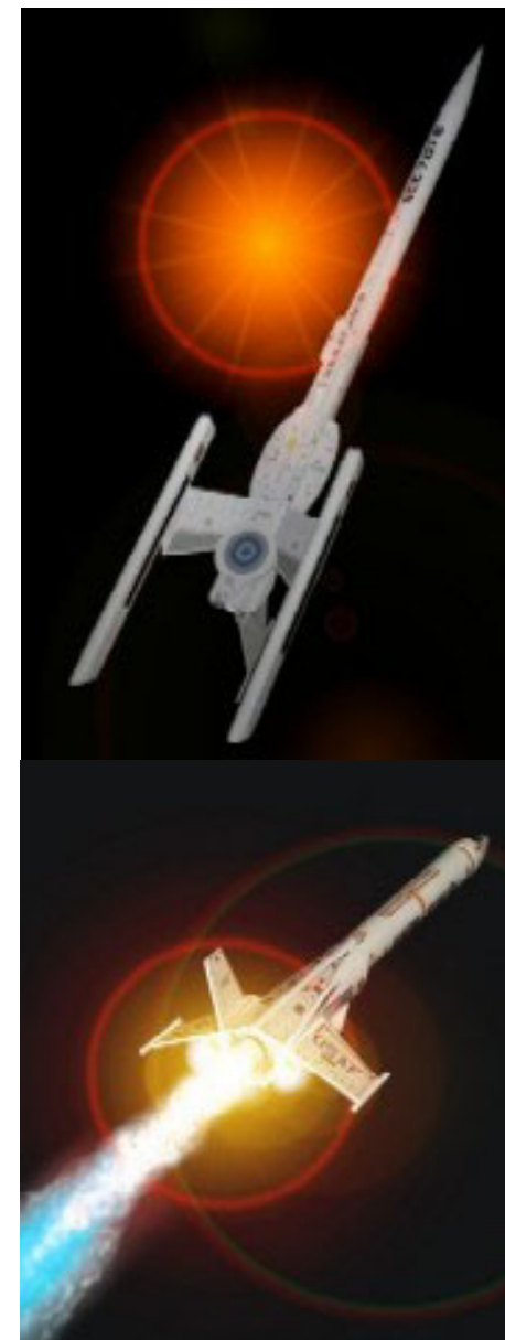
Refit U.S.S. Atlantis/Interrogator WWW.SIRIUSROCKETS.COM